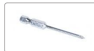
phillips screwdriver bits (included)