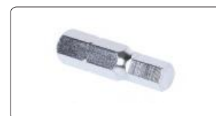
hex screwdriver bits (included)